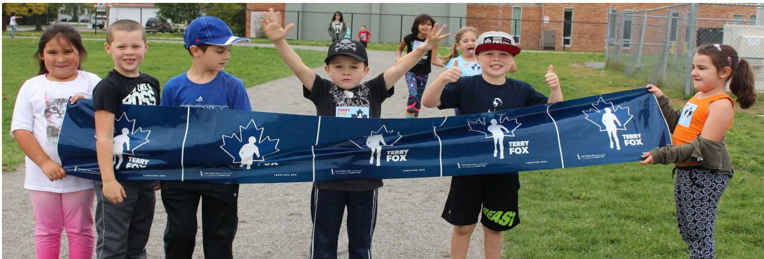
The Terry Fox Run was held on Thursday September 28th. Our entire school walked to support the Terry Fox Foundation. As a school we raised $1,036.80 to support cancer research. Great job Mustangs!

Courage is demonstrated by people who stand up for what they believe in their heart to be the right thing to do, even when others don't support them and might try to convince them that they are wrong.